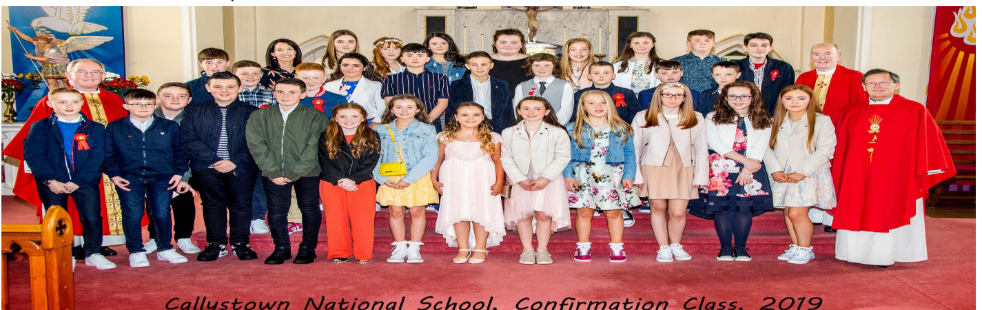
Callystown National School, Confirmation Class, 2019.